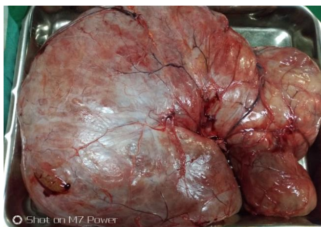
Figure 3: 40 years female presented with retro peritoneal liposarcoma of weighing 7 kg total excision.

There were totally 6 cases of Ca Penis of which 1, 3 and 2 cases diagnosed in the 41 to 50 years, 51 to 60 years followed by 61 to 70 years age group respectively.