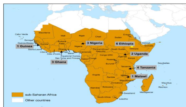
Figure 2: Pictorial view of selected studies in sub-Saharan African map.

These findings were based on the following 20 selected studies by countries across sub-Saharan African region (Figure 2).