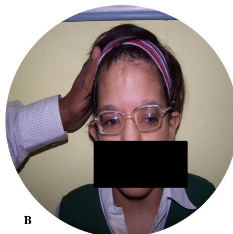
Figure 3: (A and B) Both corrected with spectacles.