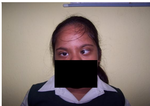
Figure 2: Squint.