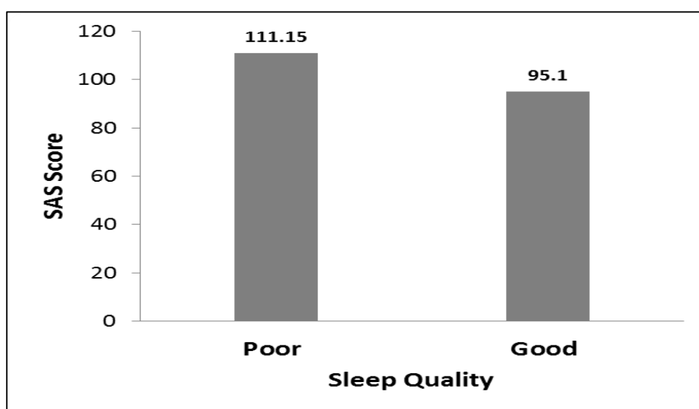
Figure 1: Mean SAS score in two groups.