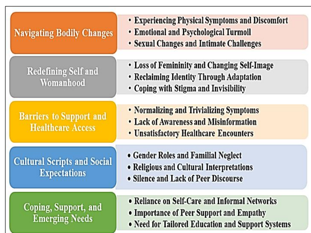
Figure 2: Themes and its subthemes of the meta synthesis.

members, peers, and even healthcare providers. This normalization created an environment where suffering was internalized, and help-seeking behaviors were discouraged or delayed. In younger women, particularly those with coexisting psychiatric conditions, the physical symptoms of menopause were compounded by medical neglect in institutional settings, such as psychiatric inpatient care, where menstrual irregularities and reproductive health concerns were often deprioritized. This further magnified the emotional and physiological toll of menopause, emphasizing a need for age- and condition-sensitive care pathways. 12-15,19,20